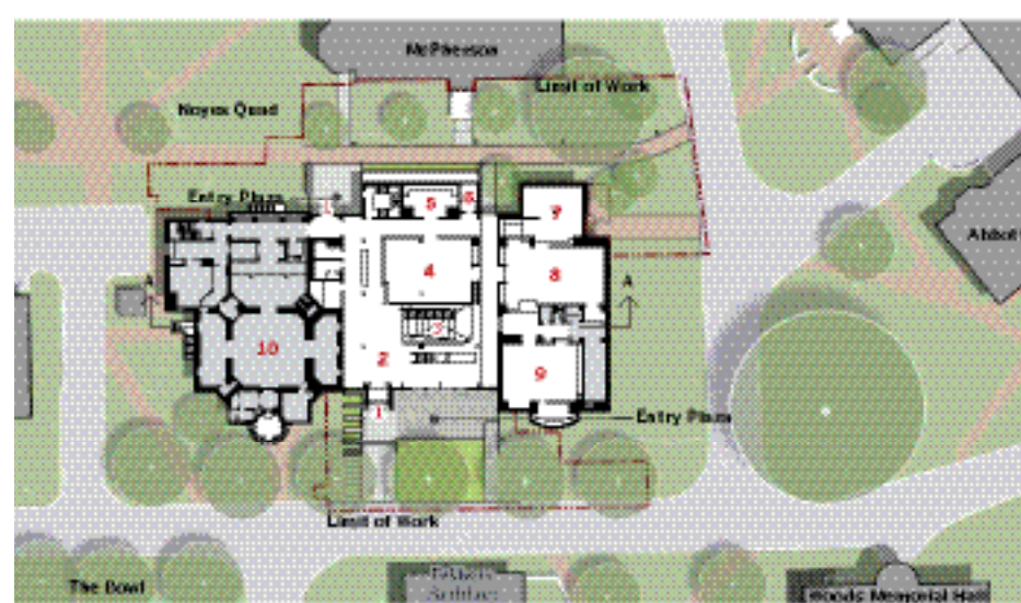
GROUND-FLOOR SITE PLAN